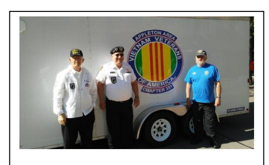
Also see at Memorial Day...