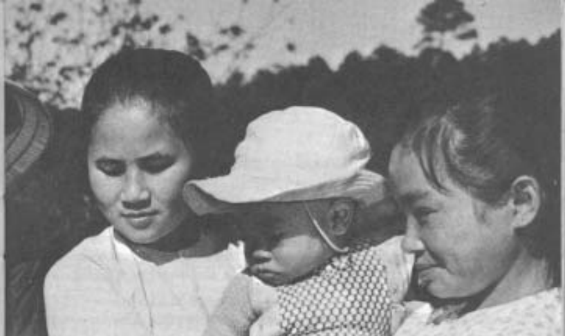
Young faces of Vietnam.

Since the purpose of marriage is to continue the family line, the parents believe that the selection of a proper wife for their son is their personal responsibility, a duty they owe both to their ancestors and to their son and his future children. Usually with the help of a "go-between," they search for a girl who is skillful at housework and who will be a good mother to many children. Beauty is not as desirable as good character. In fact, beauty is sometimes considered