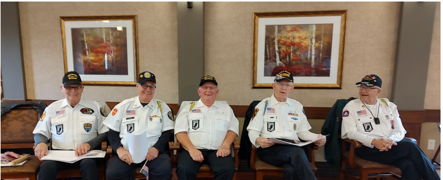
VVA351 Panel at Rennes Health Center

Fox Valley's Only Chartered Vietnam Veterans Organization Serving Area Veterans Since 1987